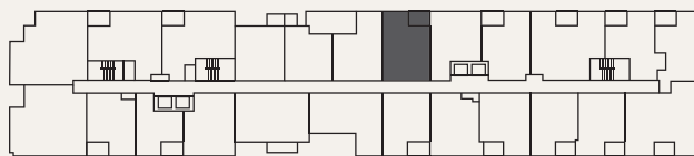
2ND AND 3RD FLOOR