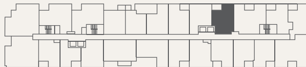
2ND AND 3RD FLOOR